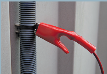
Small diameter cable tracing techniques